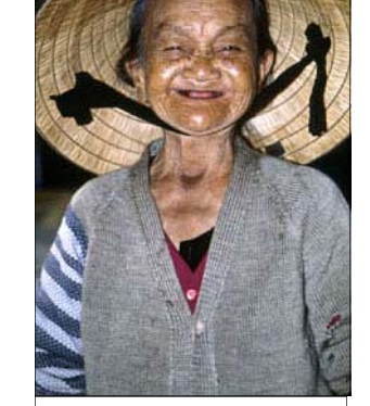
Woman of Hoi An