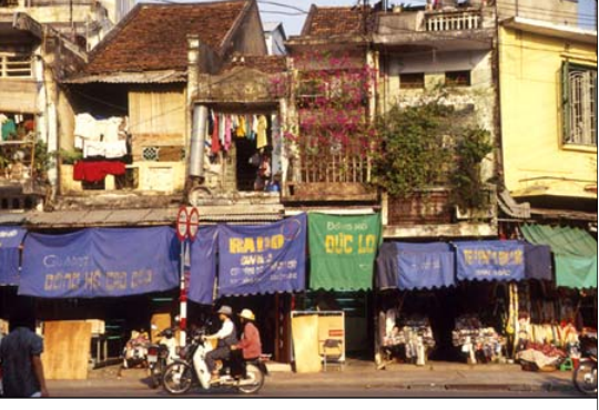
Hanoi's famous Old Quarter