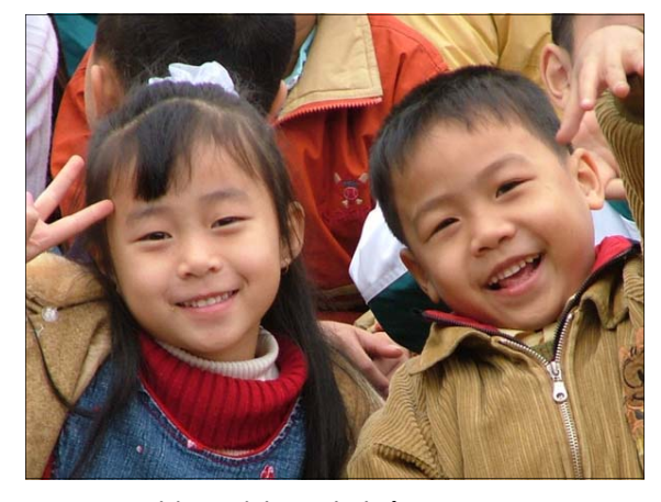
Viet Nam Welcome