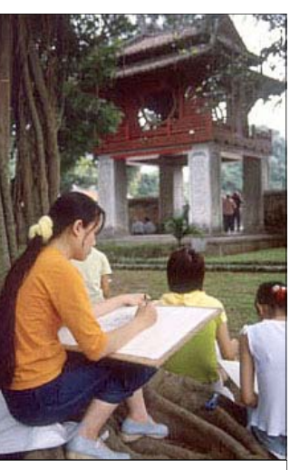
Art students in Hanoi