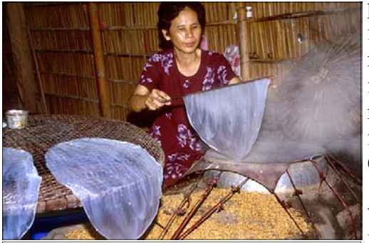
Making Rice Paper for Spring Rolls

Experience a Hu Tiu (noodle soup) breakfast, then drive to a village that makes rice paper (for culinary use) Visit the rice